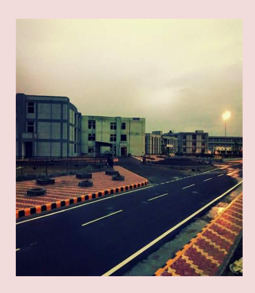
Govt. College of Engg. & Technology Bikaner, Rajasthan